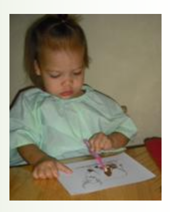
Vietnamese water buffalo, with a toothbrush. How funny!